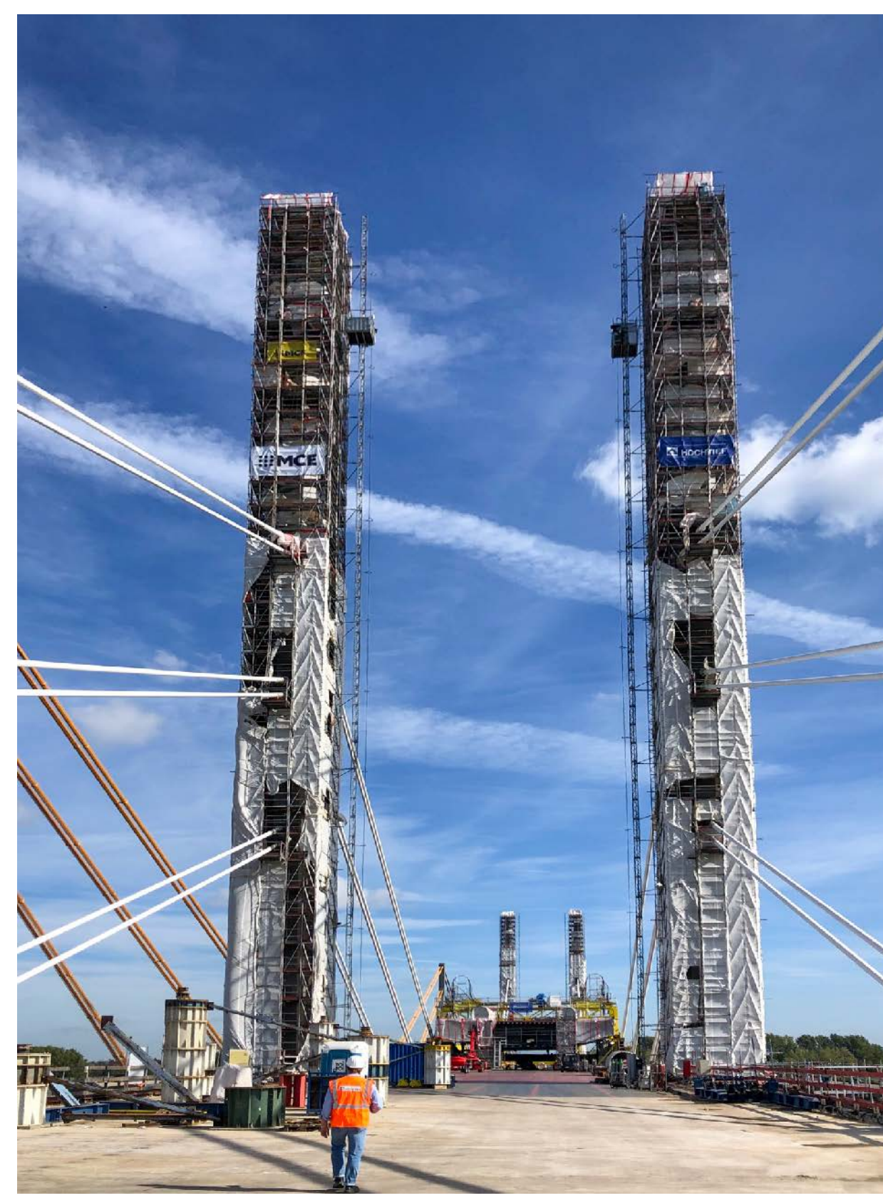
Steel cables connect the pylons to the bridge.

VHV offers what is known as risk engineering or on-site risk monitoring for major projects like this. That's why Hermann Wulke usually travels to the bridge once a year and inspects the construction site with the project manager. "First of all, we have the construction progress explained to us and check whether any rescheduling or changes in the construction process make it necessary to adjust the insurance cover. We also provide recommendations for loss prevention if we identify possible sources of danger on the construction site", explains Wulke. "We obviously can't prevent all damage. For example, last year a mentally disturbed person drove a car onto the construction field, parked it next to a pylon pillar and set it on fire. Fortunately, no significant damage was done to the pillar." DEGES estimates that from 2030 onwards, around 126,500 vehicles will cross the bridge every 24 hours on weekdays.