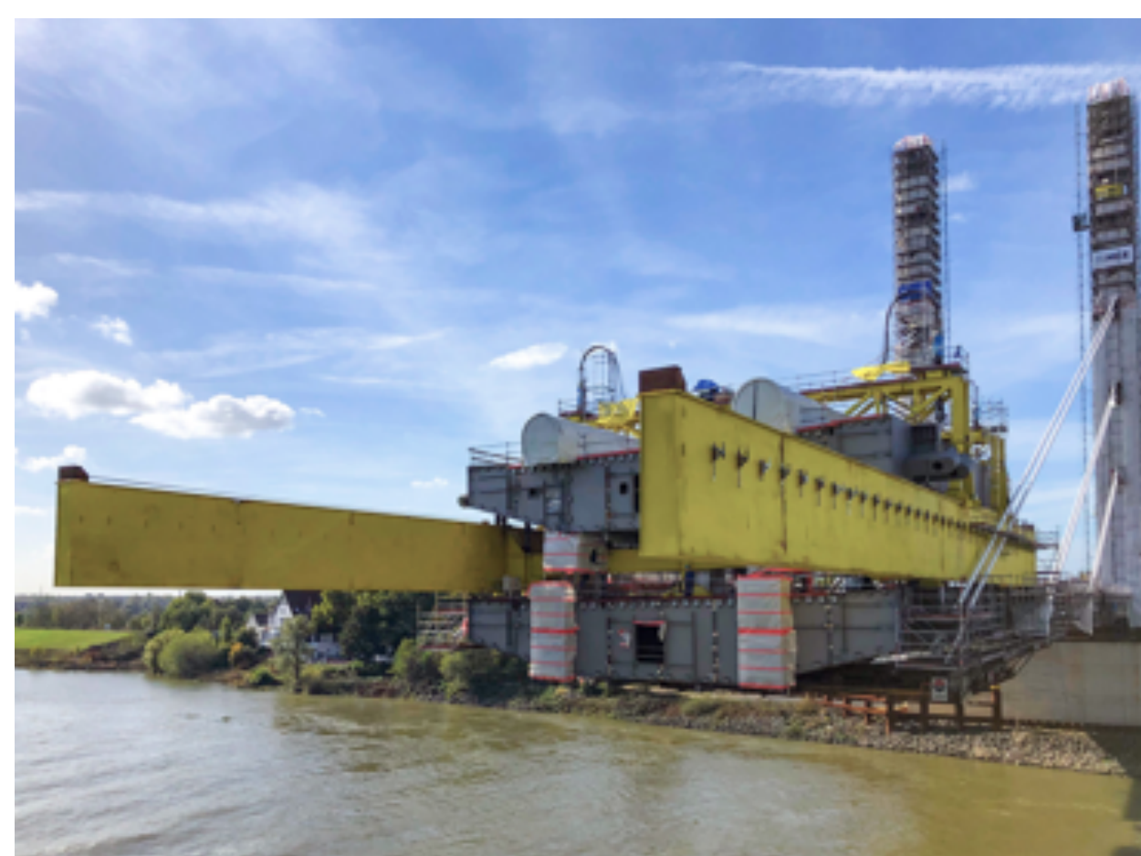
Smaller bridge segments are welded to the front end of the bridge.

The project's location also matters. Are there any natural hazards such as flooding or can neighbouring structures be damaged by the construction work? Wulke and his team are also interested in why there is a construction project in the first place. Particularly where infrastructure works are concerned, such as bridges, some structures have reached the end of their service life and their serviceability is in question, so that the replacement construction has to be carried out under time pressure. This in turn increases the risk of implementation errors or construction accidents. "We also include a company's experience in terms of the project in question in our risk assessment. In this project, for example, an entire bridge section is shifted laterally by more than 14 metres. That's hugely ambitious. Not every construction company can do that. Hochtief already successfully completed a lateral shift at the Lennetal Bridge near Hagen and so has the necessary expertise", says Wulke.